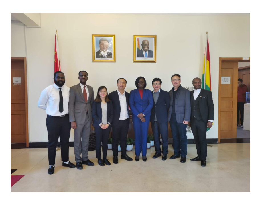
Group photo with some officials of Ghana Embassy in Beijing and Hangxiao steel structure