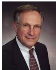
Senior Academic Chairperson