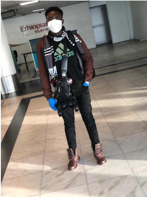
An international student of UESTC Arriving at Kotoka International airport in Ghana