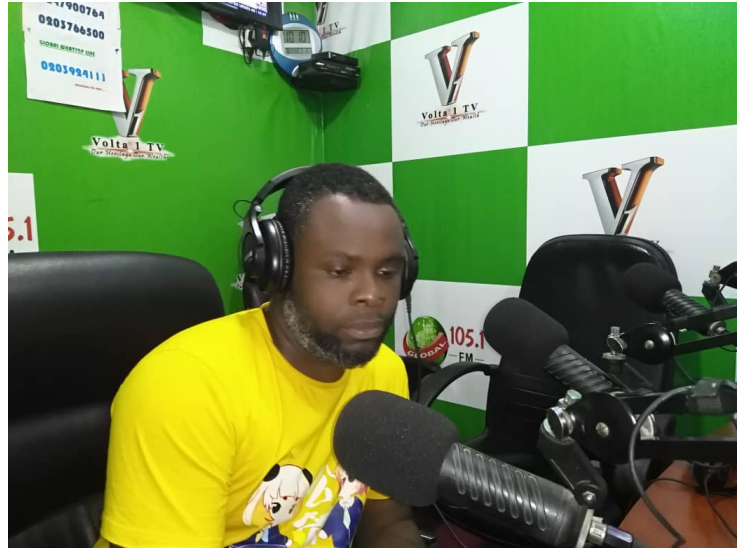
International student of UESTC discussing the corona virus situation at Global Fm in Ghana

Ghana as a peaceful country and prominent economic partners of China has put measures in place to help curb the deadly corona virus.