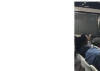
The first Academic Salon and Birthday Celebration in 2016