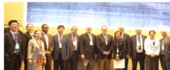
Photo of Delegates at the 2014 International Conference on Public Administration (10th ICPA) Date: October 24-26, 2014 Venue: UESTC, Chengdu, P.R. China