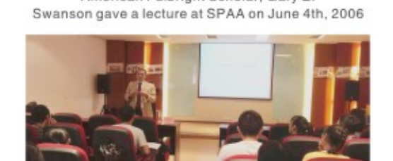
International Summer School of SPAA, UESTC (Since 2015)