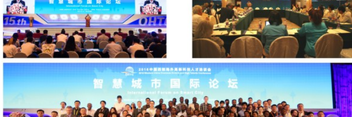
Sponsored by University of Electronic Science and Technology of China (UESTC), and Department of Foreign and Overseas Chinese Affairs, Sichuan Provincial People's Government of P.R.China, the 2016 International Forum on Smart City (IFSC) was held in Chengdu from September 12-14. The forum was one of the most important events for 2016 Western China Overseas High Tech and High Talents Conference (OHTC).