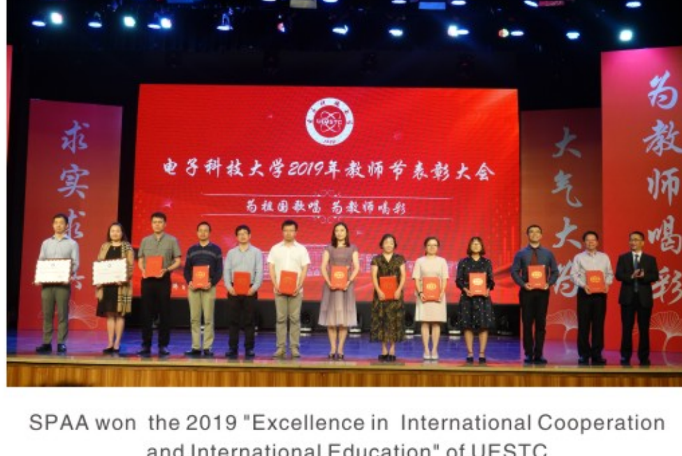
SPAA won the 2019 "Excellence in International Cooperation and International Education" of UESTC