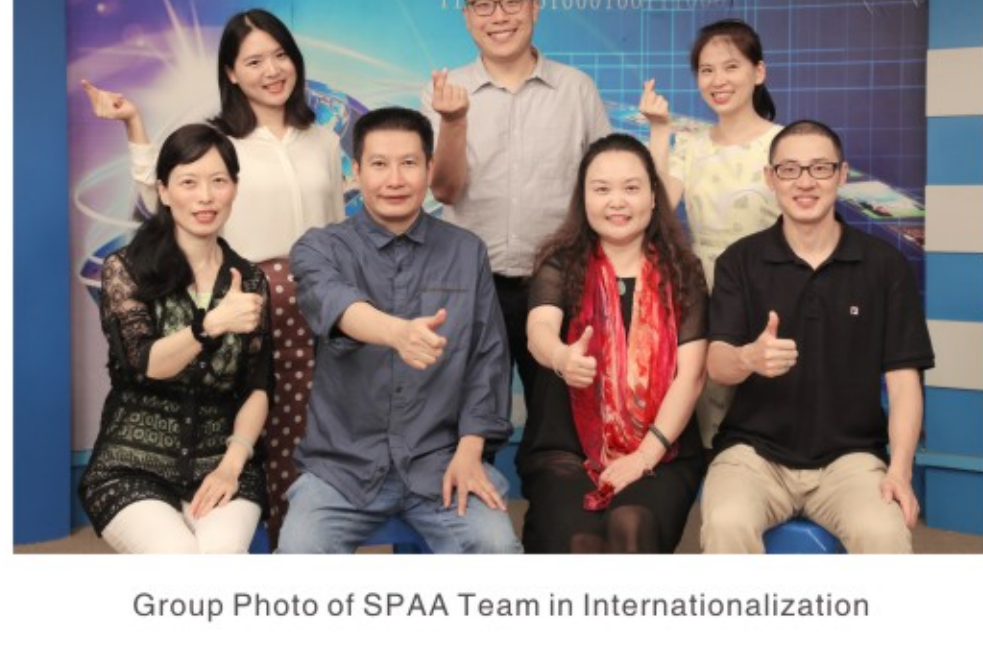
Group Photo of SPAA Team in Internationalization

Internationalization is one of the three core strategies of the School of Public Affairs and Administration (SPAA). In 2019, SPAA has won UESTC Top Award for "Excellence in International Cooperation and International Education" through the joint efforts of the faculties and students. During the 63rd anniversary of UESTC, SPAA exhibits selected memorable and valuable photos to recall wonderful moments in International Exchange and Cooperation over the past 14 years, to remain true to our original aspiration and keep our mission firmly in mind. Besides, it also enables our alumni to share our internationalized achievements, and experience towards being the "Top-class domestically, internationally renowned" Public Affairs and Administration School.