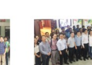
Group Photo at the Opening Ceremony for 2017 International Students