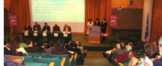
Photo from the 2008 International Conference on Public Administration (4th ICPA) Date: September 24-26, 2008 Venue: Minnesota, USA