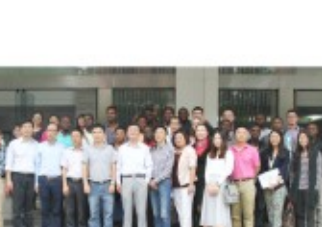
Group Photo at the Opening Ceremony for 2015 International Students

In 2015, SPAA initiated to recruit our first batch of 19 international students, a milestone in talents development and a new progress of the internationalization for SPAA. Since 2019/20 academic year, the number of our international students has been up to 74, including 7 undergraduates and 67 postgraduates from nearly 30 countries including the United States of America, Russia, Brazil, Morocco and Ghana.