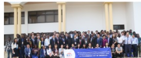
Group Photo of Participants at the 2017 International Conference on Public Administration (12th ICPA) Date: November 14-16, 2017 Venue: Accra, Ghana