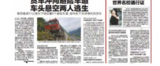
West China Daily reported: "27 students received the famous university OFFER, while one curve wrecker got 13 Top Universities Passes in SPAA, UESTC."