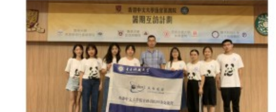
Exchange Program with The Chinese University of Hong Kong (Since 2015)