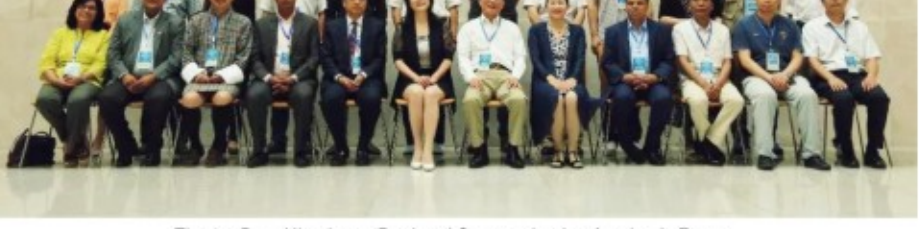
The 1st Pan-Himalayan Regional Communication Academic Forum June 8, 2016 - UESTC

The Pan-Himalayan Communication Research Center of UESTC is an academic research institution jointly established by School of Public Affairs and Administration of UESTC, Center for Digitalized Culture and Media of UESTC and Department of Languages and Mass Communication of School of Arts (SOA) of Kathmandu University (KU), Nepal. The Center adheres to the principle of "Mutual Benefit," "Resource Sharing," "Common Development" and "Win-Win," exploring the frontiers and hot issues in the process of communication and social change in the Pan-Himalayan region given "Belt and Road Initiative" for academic exchange and media cooperation among countries in the region.