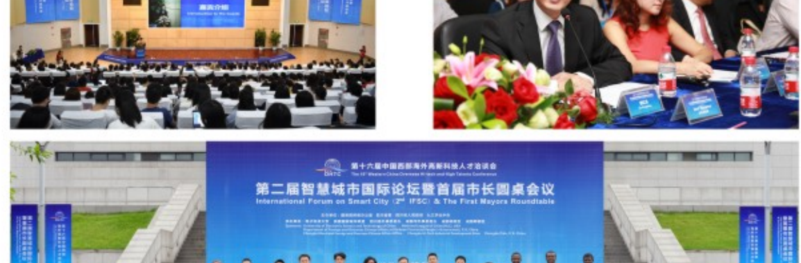
Sponsored by University of Electronic Science and Technology of China (UESTC), Department of Foreign and Overseas Chinese Affairs, Sichuan Provincial People's Government of P.R. China, and the National League of Cities (NLC), USA, the 2017 International Forum on Smart City (2nd IFSC) & First Mayors Roundtable was held in Chengdu from September 11-14. The forum was one of the most important events for 2017 Western China Overseas High Tech and High Talents Conference (OHTC).