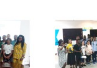
Group Photo at the Orientation Lecture for 2019 International Students