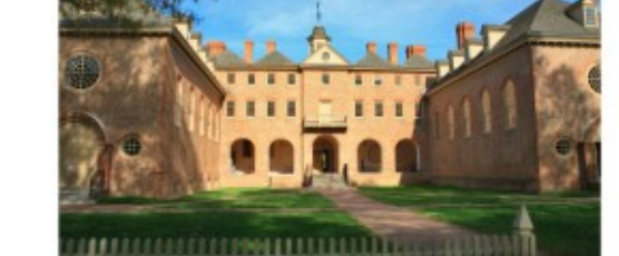
4+1 LL.M. Program with William & Mary Law School (Started in 2019)