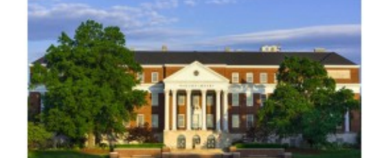
4+1 Master Degree Program with School of Public Policy, University of Maryland, USA (Started in 2019)