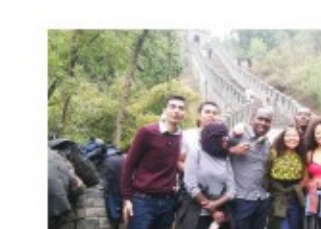
Chinese Cultural Experience Camp: Close to Haska Culture in 2019