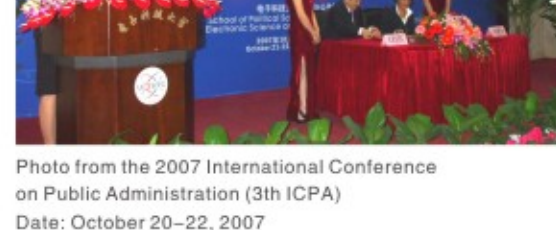
Photo from the 2007 International Conference on Public Administration (3th ICPA) Date: October 20-22, 2007 Venue: UESTC, Chengdu, P.R. China