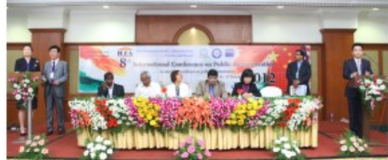
Photo from the 2012 International Conference on Public Administration (8th ICPA) Date: October 25-27, 2012 Venue: Hyderabad, India