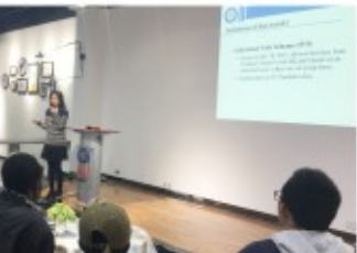
The first SPAA Workshop for Teaching & Academic Affairs in 2017