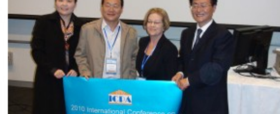
Photo of Delegates at the 2010 International Conference on Public Administration (6th ICPA) Date: October 31 - November 2, 2010 Venue: Australian National University, Canberra, Australia