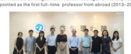
Postgraduate Humanity Education and Academic Exchange Program of SPAA, UESTC (Since 2016)