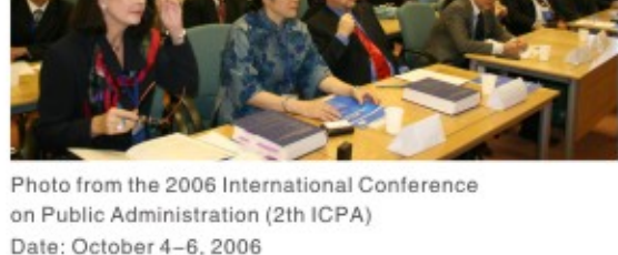
Photo from the 2006 International Conference on Public Administration (2th ICPA) Date: October 4-6, 2006 Venue: University of Warwick, Coventry, UK