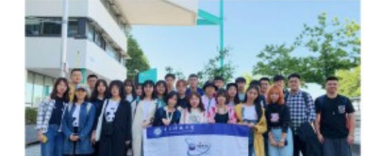
University of East London Summer Program (Since 2014)

SPAA adheres to the research-based, innovative and international education orientation for elite talents. We take initiatives to implement the featured strategy of internationalization by offering a talent training mode of "Initiating from Europe-America and expanding worldwide". About 40% students at SPAA have studied abroad on short term exchange programs, while up to 30% of undergraduates furthered their studies in some of the world's top universities in 2019.