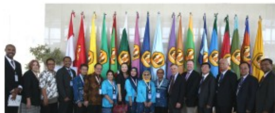
Photo of Delegates at the 2015 International Conference on Public Administration (11th ICPA) Date: December 9-11, 2015 Venue: Padjadjaran University, Indonesia