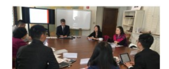
UESTC delegation visited the Maxwell School of Citizenship and Public Affairs, Syracuse University, USA (NO.1 in Public Affairs in USA)