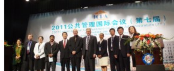
Photo of Delegates at the 2011 International Conference on Public Administration (7th ICPA) Date: October 18-20, 2011 Venue: UESTC, Chengdu, P.R. China