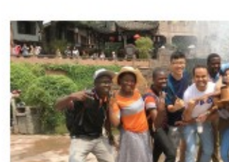
Chinese Culture Tour: Visit to the Silk Road in Western Sichuan in 2018