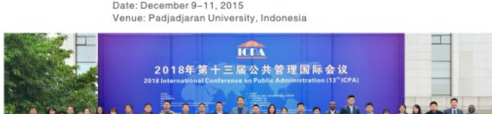
Group Photo of Participants at the 2018 International Conference on Public Administration (13th ICPA) Date: November 20-December 2, 2018 Venue: UESTC, Chengdu, P.R. China