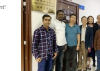
The delegates of CWAS were invited to attend the 4th Annual Conference of the Center for International and Regional Studies of the Ministry of Education in November 2018