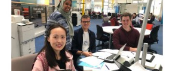
Double Master's Degree in Public Management & International Public Policy with University of East London, UK (Since 2017)