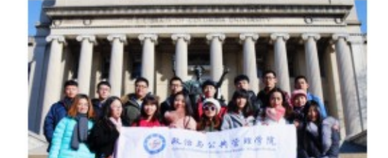
The City University of New York CUNY Program (Since 2017)