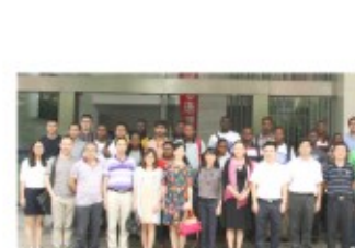
Group Photo at the Opening Ceremony for 2016 International Students