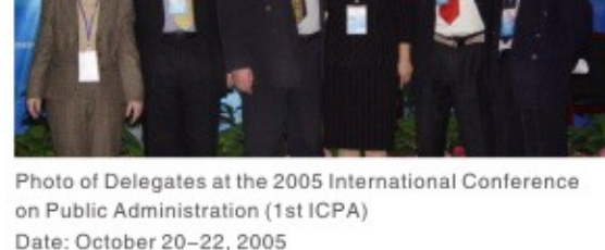
Photo of Delegates at the 2005 International Conference on Public Administration (1st ICPA) Date: October 20-22, 2005 Venue: UESTC, Chengdu, P.R. China

Co-sponsored by the American Society for Public Administration (ASPA) and the Chinese Public Administration Society (CPAS), SPAA has been dedicated to annual International Conference on Public Administration (ICPA) since 2005, which "has gradually developed into a worldwide academic event with large scale, high level influence in the international field of public administration" (cited from PA Times January 2011 by ASPA). ICPA has served as an important platform for research institutions, academics and practitioners of public administration to exchange their latest findings, share ideas and update their knowledge for further professional development. ICPA has been widely known by Guangming Daily, China Daily, People's Daily online, Xinhuanet and other official media.