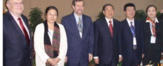
Photo of Delegates at the 2009 International Conference on Public Administration (5th ICPA) Date: October 23-25, 2009 Venue: UESTC, Chengdu, P.R. China