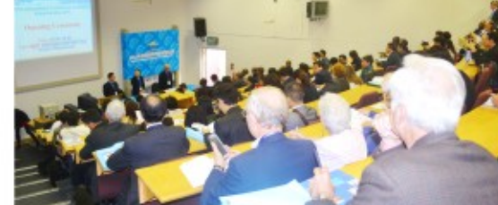
Photo from the 2013 International Conference on Public Administration (9th ICPA) Date: October 31 - November 2, 2013 Venue: Cape Town, South Africa