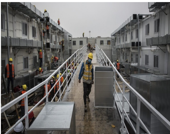
Wuhan New Hospital construction