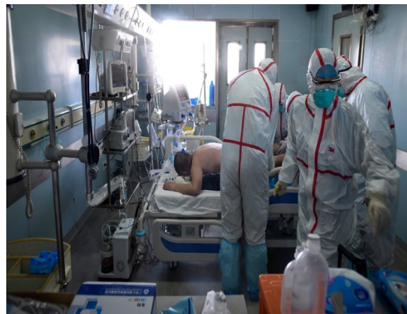
CoViD-19 Infected people treatment Wuhan Hospital