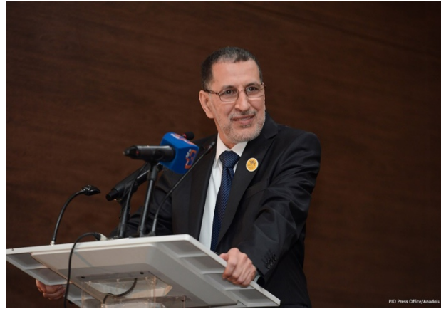
Morocco's Prime Minister, Saadeddine Othmani

Othmani also warned that those publishing rumors about the outbreak “bear great responsibility” for causing terror and panic among members of the public. The coronavirus is a potentially fatal and highly contagious disease that causes severe acute respiratory infection. The WHO has declared a global health emergency over the outbreak, but has not yet classified it as a “pandemic”. According to Freedom House, Morocco’s strict laws mean internet users may be punished for their online activities under the penal code, the antiterrorism law and the press code and this law was applied in the case of this woman for her criminal act.