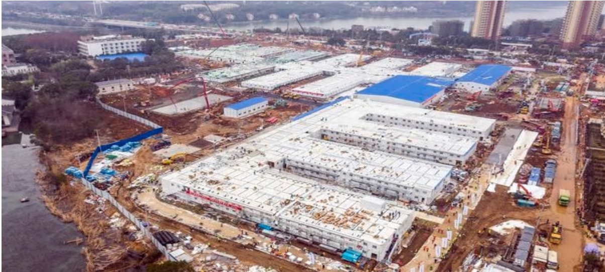
Leishenshan Hospital in Wuhan City