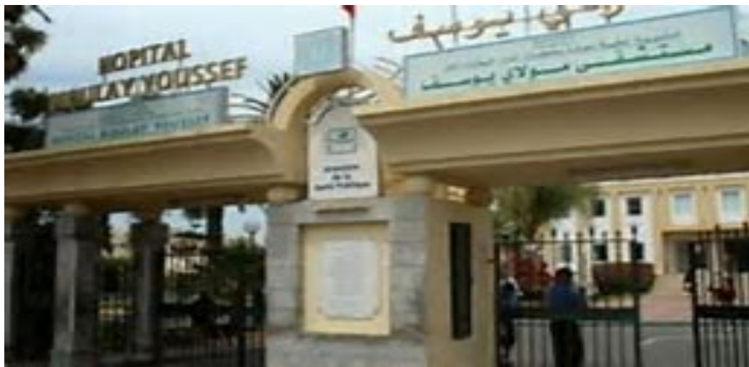
Moulay Youssef Hospital – Morocco-First case of CoViD-19 quarantine

On the other part, the Moroccan government is getting well prepared to handle the virus and prevent it from spread. With its second confirmed case on the 5 th of March. Morocco has prepared in every single city's hospital quarantine and isolation rooms, use media to sensitize people to take the necessary precautions and preventions for their safety. The director of public health office in the region of Casablanca-Settat has declared that the situation is under control in the kingdom, the 2 confirmed cases both are Moroccan nationals living in Italy.