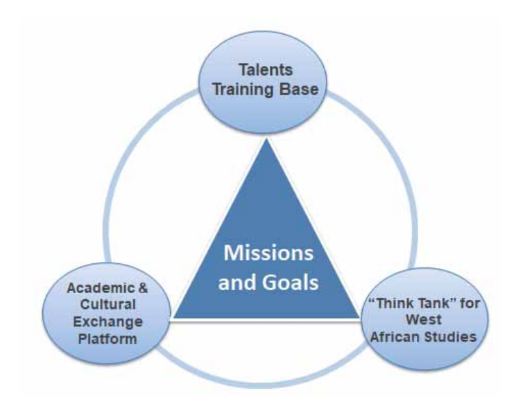
Missions and Goals

CWAS creates "1+1+1" new model of a Talents Training Base, a high level Academic & Cultural Exchange Platform and a featured top class "Think Tank" for West African studies.