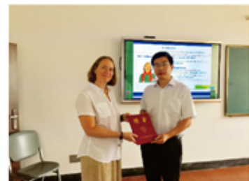
Invited Lecturer from Syracuse University, USA