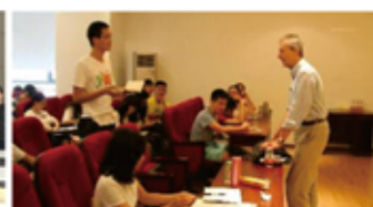
International Summer School for Undergraduates