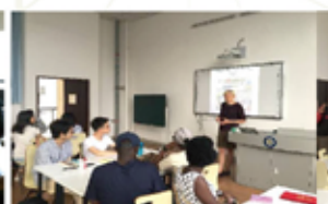
Postgraduate Humanity Education and Academic Exchange Program