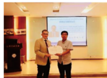
Invited Lecturer from Moscow State University, Russia