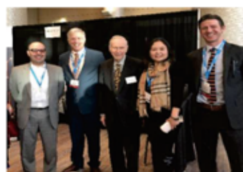
Meeting with Public Administration Review Journal (PAR), USA