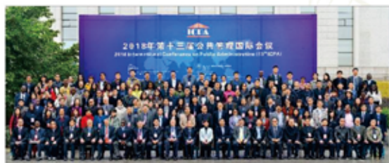
International Conference on Public Administration (ICPA)

International Summer School for Undergraduates Postgraduate Humanity Education and Academic Exchange Program