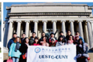
The Short Term Exchange Programs