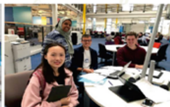
Double Master's Degree Program