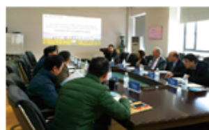
Meeting with Delegation of the University of Maryland, USA