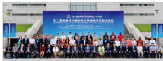
International Forum on Smart City (IFSC) & Mayors Roundtable